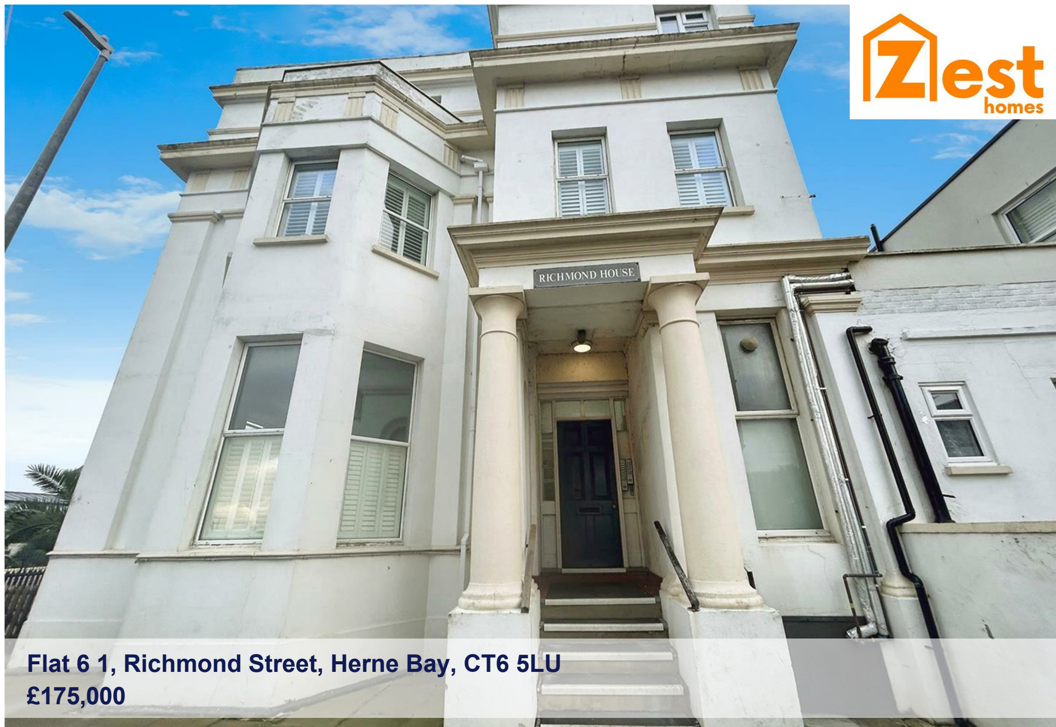
Flat 6 1, Richmond Street, Herne Bay, CT6 5LU £175,000